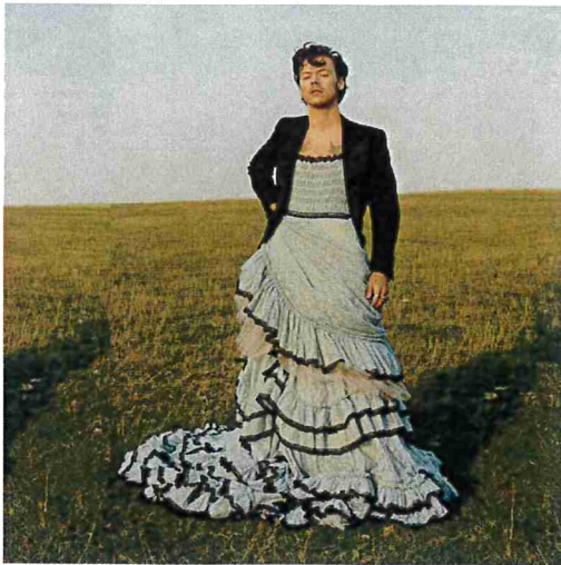
This dress by Giorgio Armani is being worn by singer Harry Styles for a picture that went on the cover of Vogue magazine. Giorgio Armani is believed to be the richest openly bisexual person in the world.