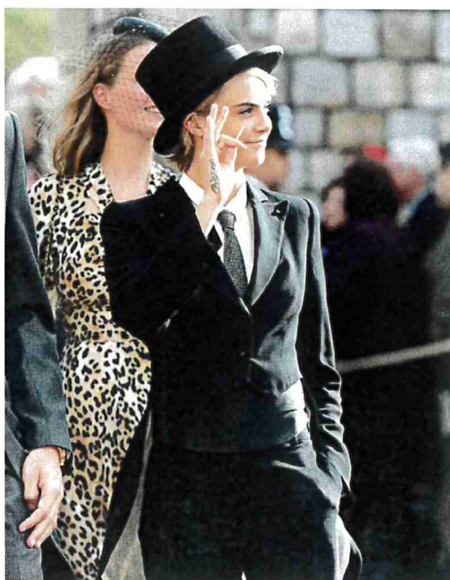
Cara Delevingne here is wearing a tuxedo to the wedding of Princess Eugenie. It was also designed by Giorgio Armani.