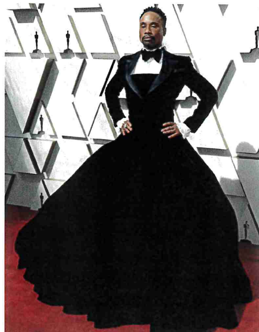
Christian Siriano is a gay designer who is renowned for dressing women of all shapes and sizes. More recently, Siriano has been designing show-stopping gowns for male actor, Billy Porter.